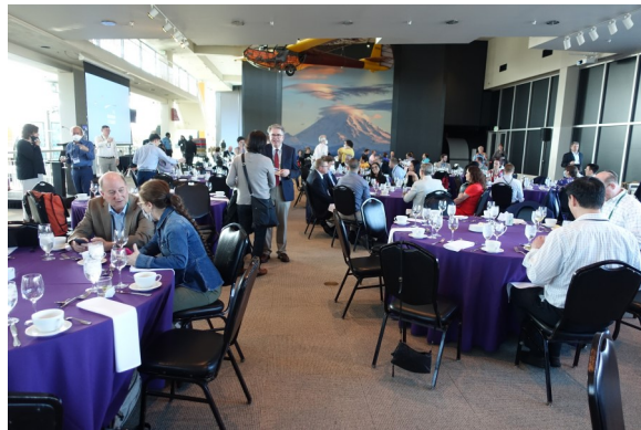
Attendees enjoyed the ability to connect with colleagues at the banquet.