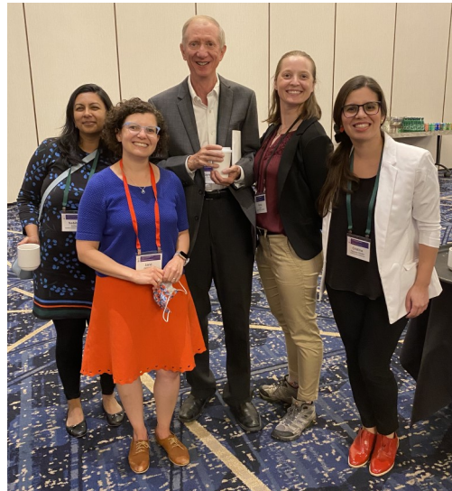
Attendees are all smiles during one of the breaks between scientific sessions! →