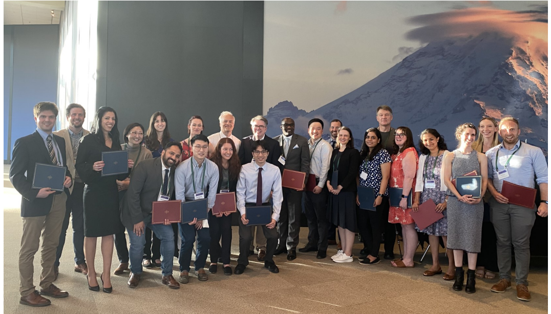
The YIA Awardees celebrate at the banquet.